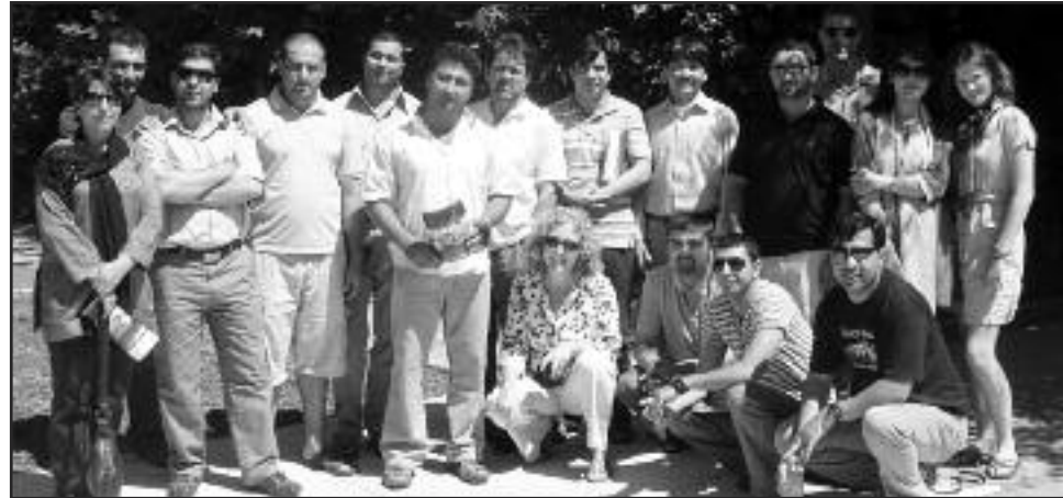
Afghan scholars and faculty from Washington State University pose after a visit to the Nisqually Valley National Wildlife Refuge.

At WSU the scholars participated in courses such as Leadership and strategic Management, Policy Analysis, International Rela-